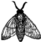
Figure 2: A sample black and white graphic (.eps format) that has been resized with the epsfig command.